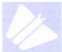
ORIENTAL FRUIT MOTH